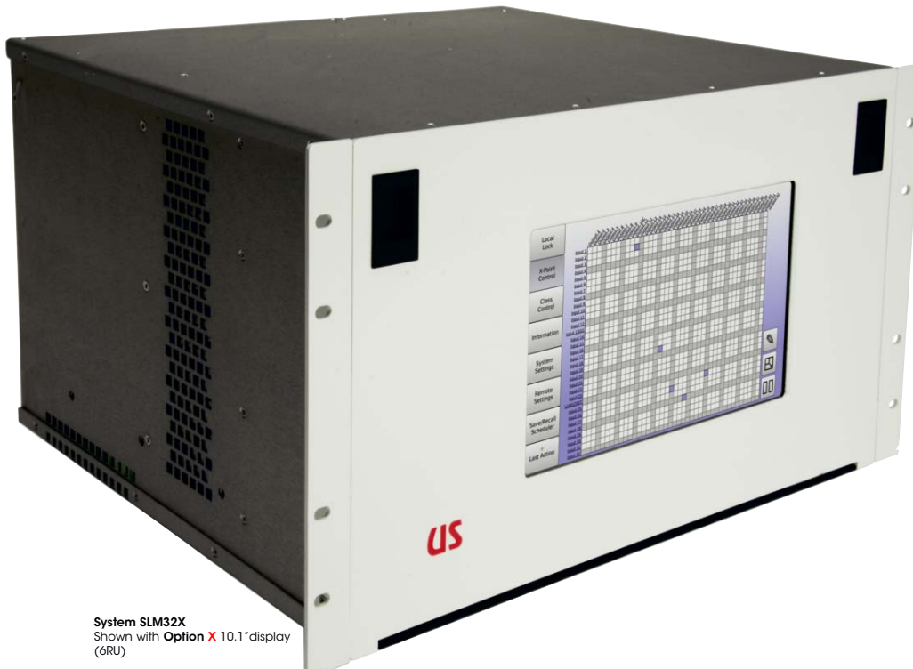
System SLM32X Shown with Option X 10.1" display (6RU)