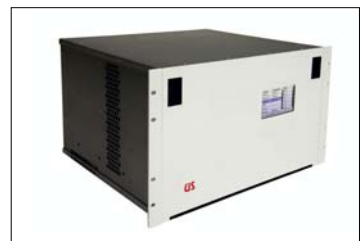
System SLM32 Shown with standard 4.3" display